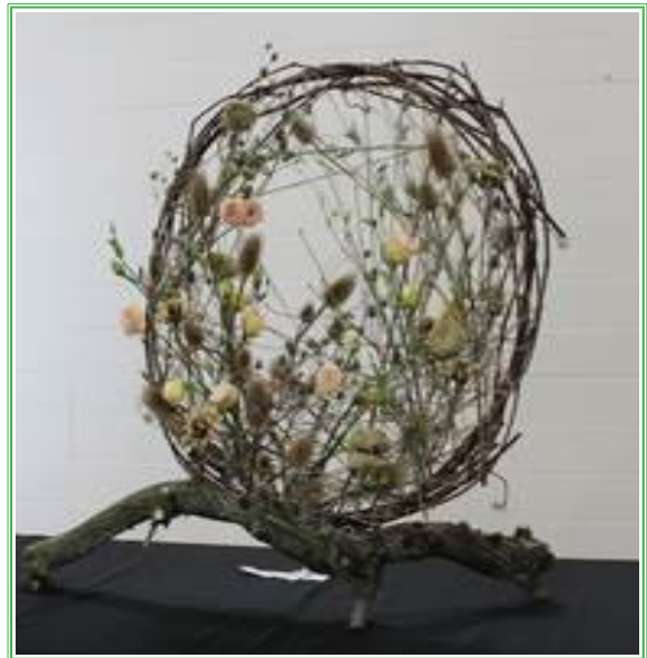
Flower Arrangements from the Nanaimo Flower Show.